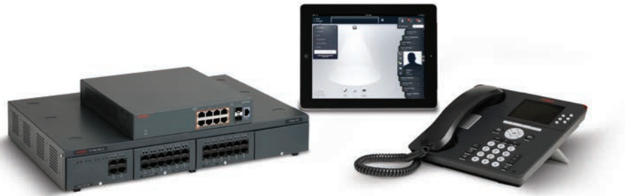
Figure 2: ERS 3500 with IP Office, the Avaya Flare® Communicator for iPad Device and an Avaya 9600 handset

Avaya has also validated interoperability between the ERS 3500 and the IP Office system to ensure the two products work together seamlessly. This eliminates any complexities associated with having to provision, manage and troubleshoot a third party Switch with the Avaya voice / unified communications infrastructure. A Technical Solutions Guide, available to partners and end customers, showcases best practice configurations, ensuring optimal performance of the solution.