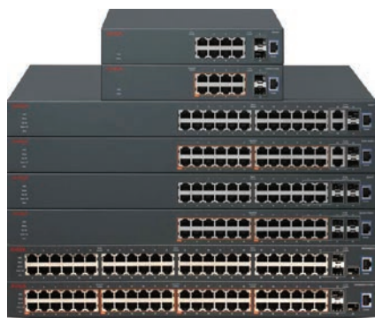
Figure 1: The ERS 3500 product family